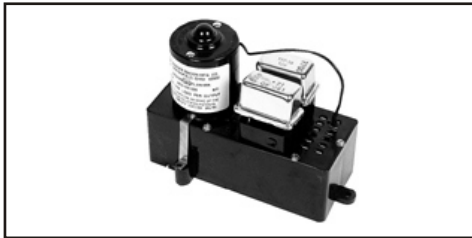
Baader-Brown 6404-1125 & 6404-1920